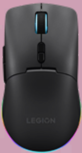
Lenovo Legion M220 Wireless RGB Gaming Mouse GY51U28359