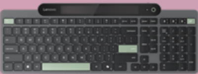
Lenovo Self-Charging Bluetooth Keyboard-French Canadian 058 4Y41R69498

Lenovo may not offer the products, services or features discussed in this document in all regions. Lenovo may withdraw an offering at any time. Consult your local representative for information on offerings available in your area. Lenovo reserves the right to change specifications or other product information without notice. Lenovo is not responsible for photographic or typographical errors. Lenovo provides this publication "as is" without warranty of any kind, either express or implied, including the implied warranties of merchantability or fitness for a particular purpose.