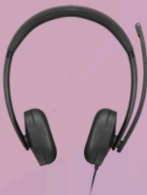
Lenovo Wired VoIP Headset 5000 4XD1R88995

Please click here to view the full list of accessories.